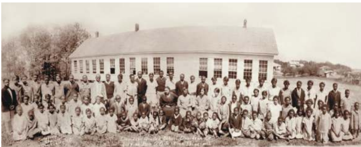
Original Schoolhouse, 1929

True to our proud past, the Ada Jenkins Center trusts in and depends upon the power of community. Our founders, staff and Board of Directors strongly believe that unforeseen circumstances can place people of all walks of life at risk. Whether a family is struggling due to illness, job loss or other life situations, we are here to help, working together to provide our neighbors with the tools they need to improve their quality of life and achieve long-term success.